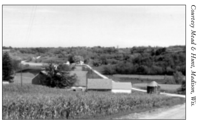
This farm near Nanson on Hwy. 14 is in the Goodhue County rural landscape project area.

For further information on the project, contact SHPO at (612) 296-5462.