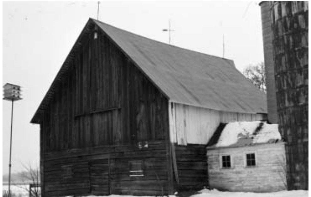
Workshop participants will have an opportunity to visit a variety of Isanti County barns, including the Olaf Olson log barn in Dalbo Township.

Rounding out the morning program, a group of Minnesota contractors specializing in barn repair will discuss their work and answer questions from