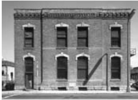
Chicago Milwaukee St. Paul and Pacific Freight House before (left) and after rehabilitation for commercial use.

Hennepin County: Chicago Milwaukee St. Paul and Pacific Freight House (1879), Minneapolis. Originally built as a freight office, the building was converted into a Dunn Bros. Coffee Shop and offices using federal preservation tax incentives. Work included cleaning and repointing the brick and stone, replacing windows, adding a wheelchair ramp and deck, installing a new mechanical system and remodeling the interior.