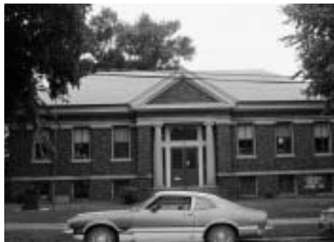
Dawson Carnegie Library before (left) and after rehabilitation for office use.

Lac qui Parle County: Dawson Carnegie Library (1917-18), Dawson. This Neoclassical building has been rehabilitated as a law office using federal preservation tax incentives. Work included caulking and painting windows and doors, replacing roof shingles, repairing and painting interior plaster, refinishing bookshelves, and updating electrical and heating systems.