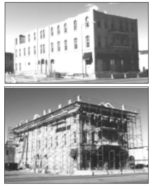
The Nicollet Hotel, listed on the National Register of Historic Places, sustained major damage. The new owners who acquired the building following the storm expect it to reopen in the spring.

The funds provide gap financing grants and loans after insurance and other sources of assistance have been exhausted to owners of historic properties damaged by the tornadoes. Many owners have reported that without the technical and financial assistance available through this program, their work would not have been possible. The additional funds are making it possible to assist more property owners and to increase the level of assistance to others. Applications are still being accepted.