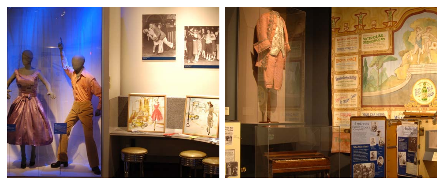
Figs. 4 and 5: When an occupancy sensor detects motion in the exhibit gallery, lights on the second circuit of the two-circuit system come on to boost lighting to a level sufficient for viewing all objects comfortably.

control zones. A front-and-rear or sideto-side arrangement is the easiest to manage. Consider creating additional spot zones for prominent or particularly sensitive artifacts in the exhibit.