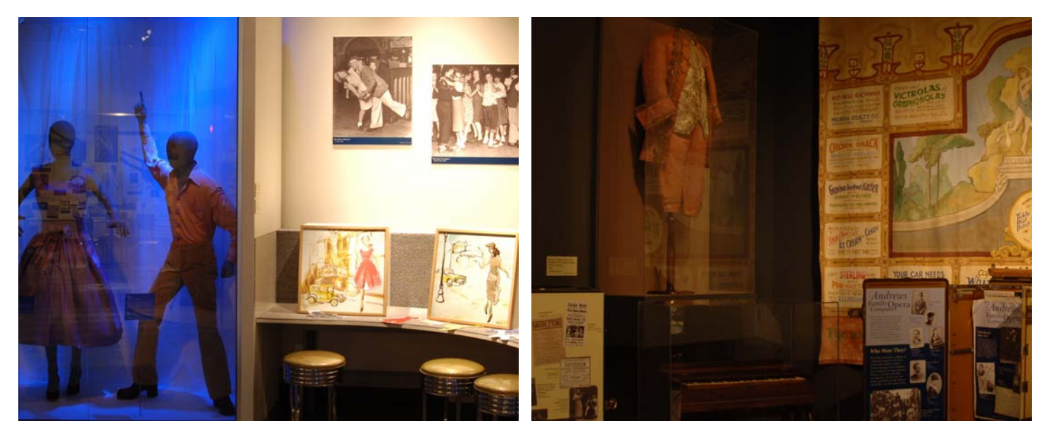
Figs. 2 and 3: In a two-circuit track lighting system with an occupancy sensor on only one circuit, the circuit without sensor provides a constant level of light. You may choose a combination of minimal lighting on sensitive artifacts with bright light for nonsensitive areas (left) or a uniformly low level of light throughout (right).

Reducing the duration of light exposure is probably the most beneficial and cost-effective measure you can take to minimize its damaging effects. Among the strategies you might use: