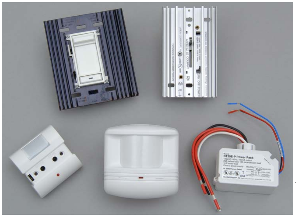
Fig. 1: Among components of a system to reduce the intensity and duration of light on sensitive artifacts are (top row) dimmer switches and (bottom row) occupancy sensors with power pack.

Let's say your museum is open six days a week for seven hours a day, 52 weeks a year. And let's say that the light illuminating that wedding dress in your permanent exhibit measures 200 lux. Assuming that the light remains on during museum hours, in one year the