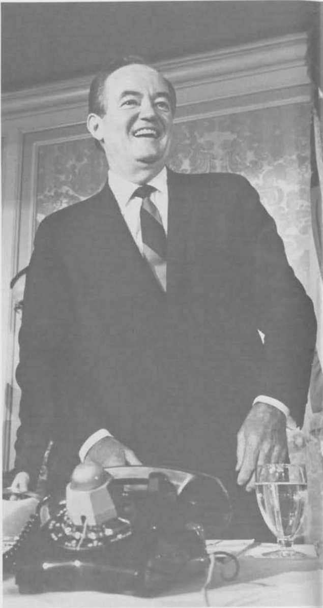
Excerpts from a speech by Vice President Hubert H. Humphrey Democratic-Farmer-Labor State Convention, Minneapolis, Minnesota June 22, 1968

I want to take this opportunity—in the words of a very great American—to talk sense to our fellow citizens and our fellow DFLers.