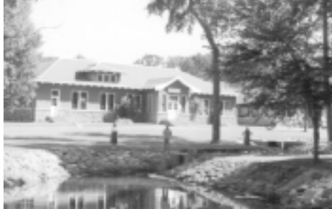
Minnesota Historical Society

If you're a historian, architect, planner, public official, property