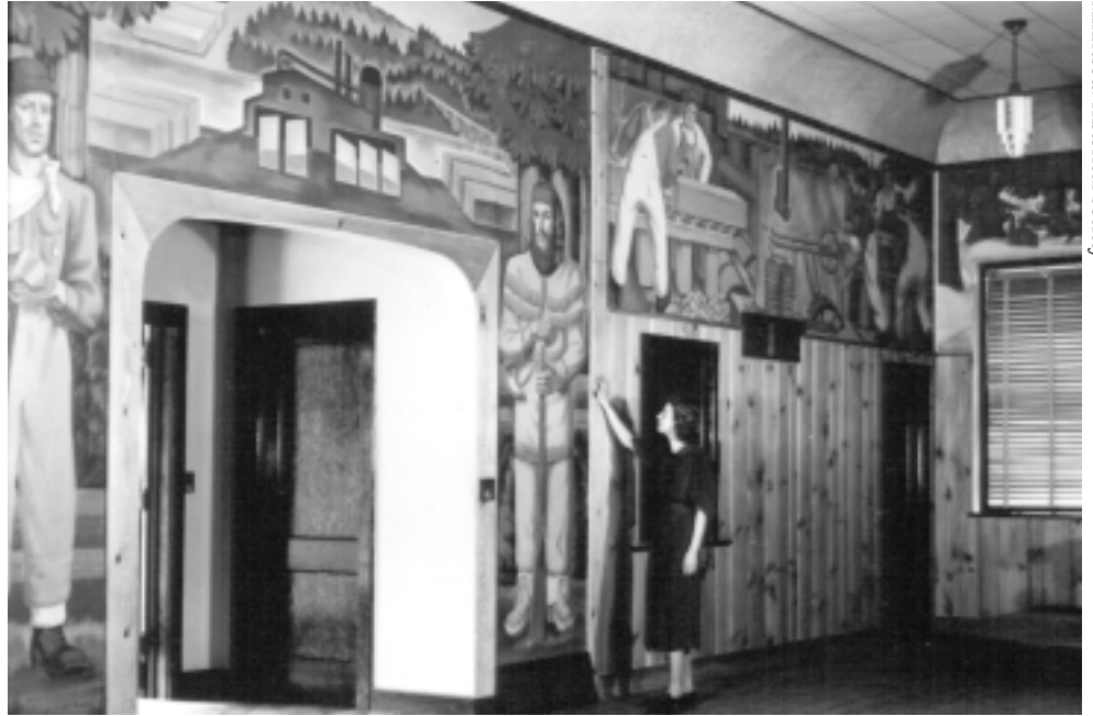
Minnesota Historical Society