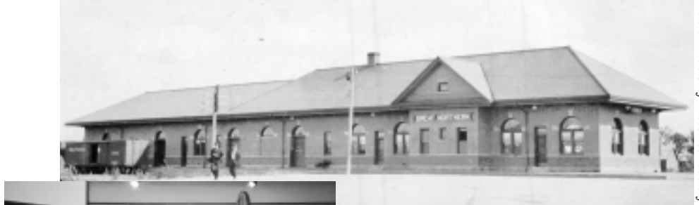
Beltrami County Historical Society