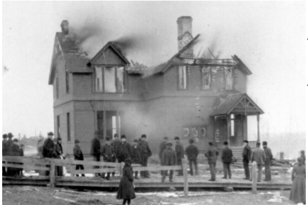
Students watched as Carlton School burned in 1914. To prepare for a future exhibit, the Carlton County Historical Society is gathering photographs and oral histories on rural education in the county.

From January to June the Cottonwood County Historical Society hosted Windom Area High School