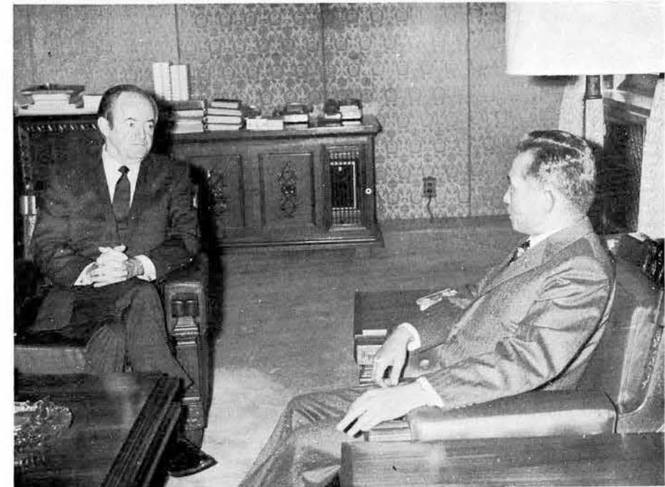
Visiting former U.S. Vice President Hubert H. Humphrey exchanged views with President Park Chung Hee during a visit to the presidential residence in Seoul on the 29th of October.

That is why I have stressed the theme of partnership today. We have a joint venture—Koreans and Americans. Its goal is expanding prosperity and ultimate peace. Its risks are great—and ever present. But its guarantors are the strongest possible—the united wills and hearts of two great peoples.