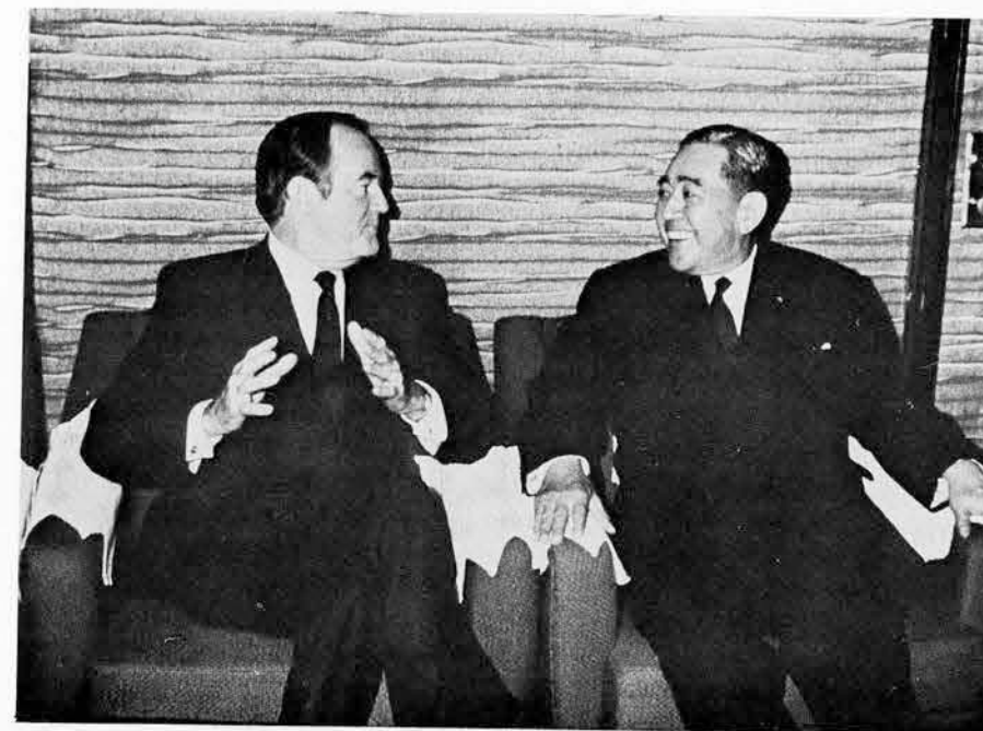
Former U.S. Vice President Hubert H. Humphrey conferred with Japanese Premier Eisaku Sato at the latter's official residence in Tokyo on the 21 st of October.

And in the political area, some Japanese critics have chosen to view a broad-based American guarantee of military protection as a device of