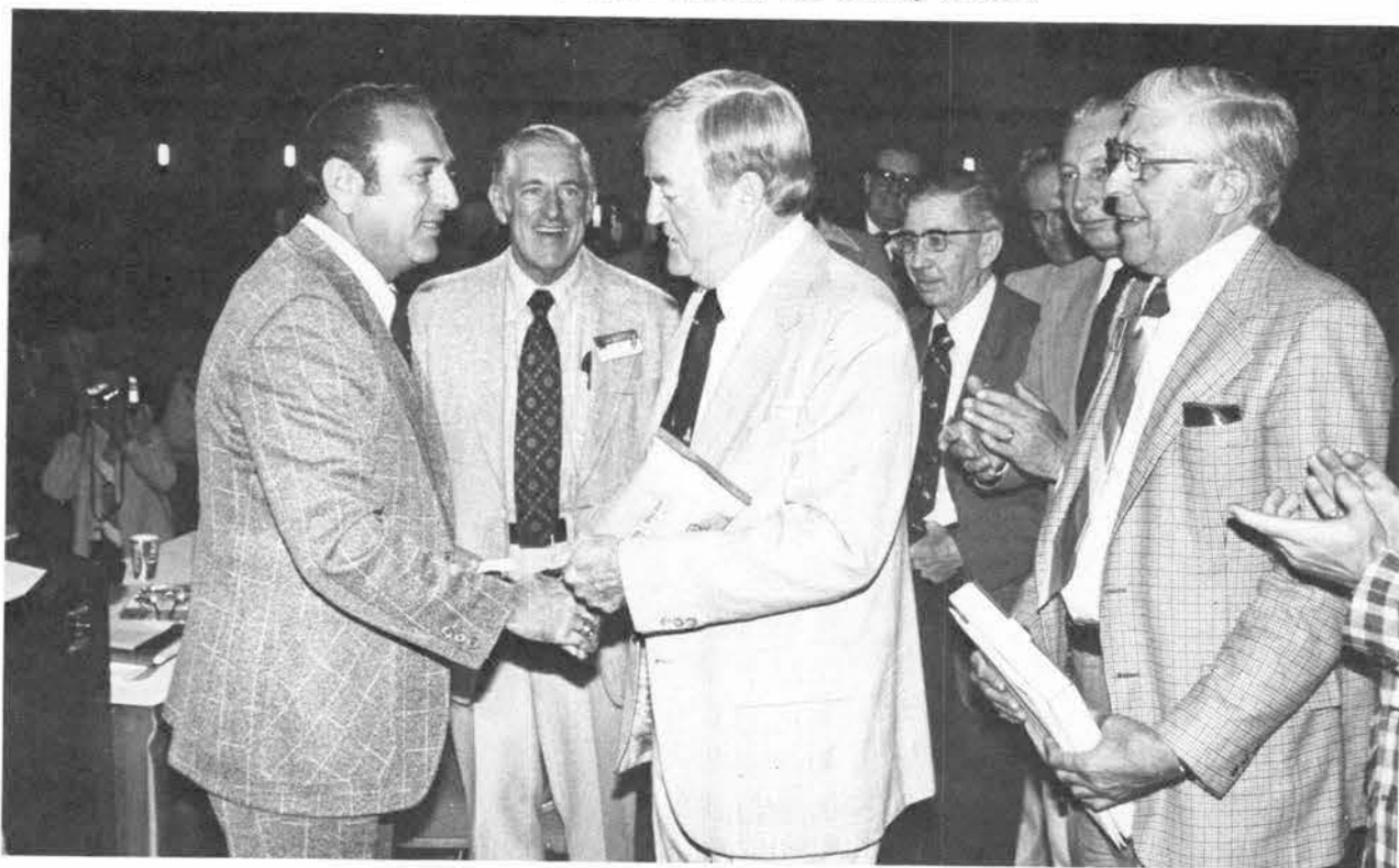
Goodman, Grubb, Senator Humphrey and admiring onlookers.

Over seven million persons today are officially unemployed. Another four million either have become so